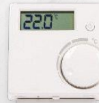
EC10015 - EHC Wireless Room Thermostat