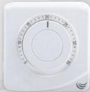
EC10012 - Room Thermostat