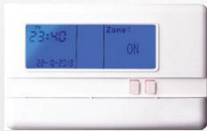
EC10001 - Single Channel Programmer