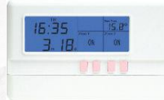
EC10002 - Twin Channel Programmer