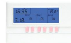
EC10003 - Three Channel Programmer